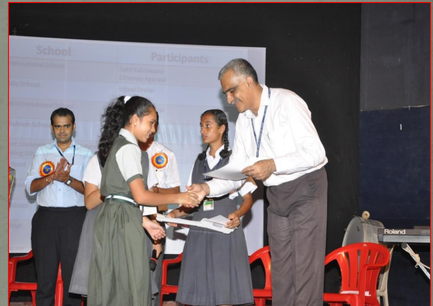
ATUL VIDYAMANDIR – BEST PRESENTER