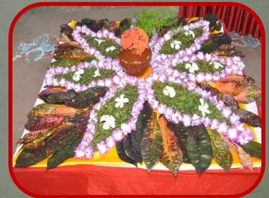
SHAPING THE FUTURE