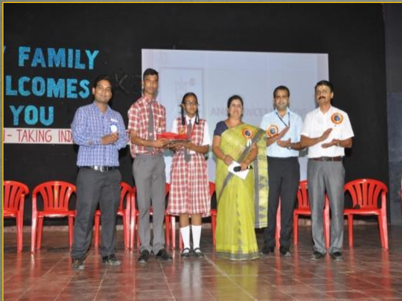
UPASNA LIONS SCHOOL BEST TEAM